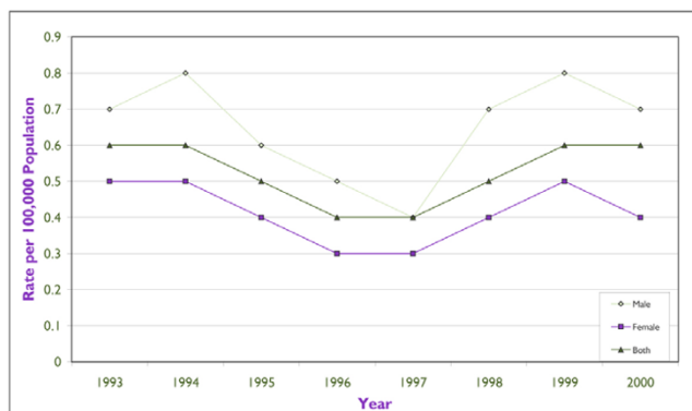
Figure 6 Reported Infectious Syphilis Rates in Canada

males to have been forced into their first sexual encounter[49]. Men have more control than women over condom use. Women are uncomfortable about insisting on condom use for fear of the reactions of their male partners regarding trust and commitment issues[50,51]. The power differential and potential for domestic violence create barriers that may prevent women from protecting themselves[52]. Therefore, prevention programs for women need to target safer sex negotiation skills and female-controlled methods[53,54].